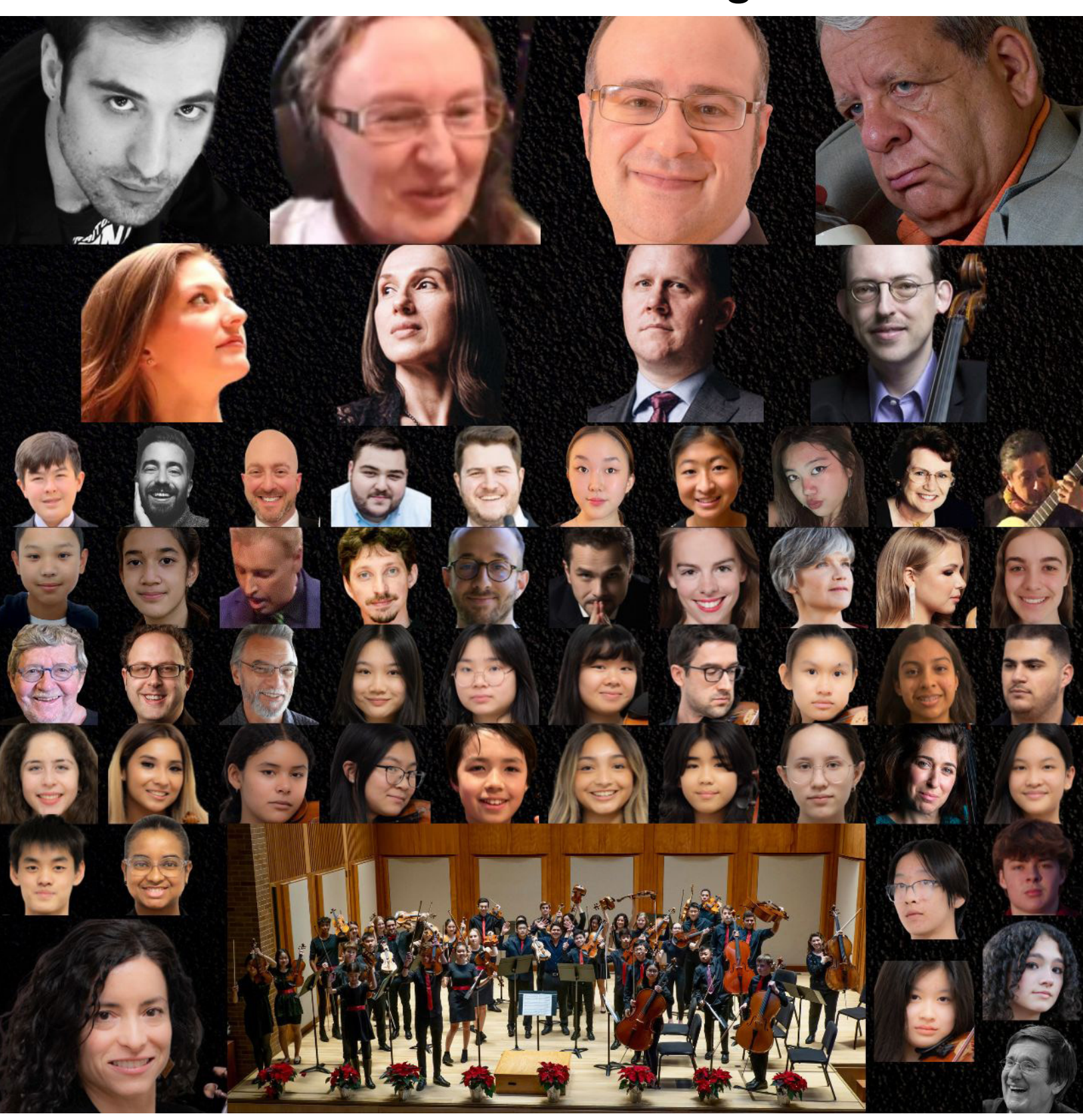
Monday April 1, 2024 @ 7:00pm