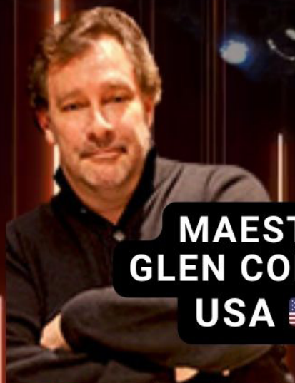
MAESTRO GLEN CORTESE USA 🇺🇸