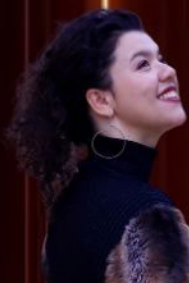
FRANCE 🇫🇷 MIA MANDINEAU SOPRANO